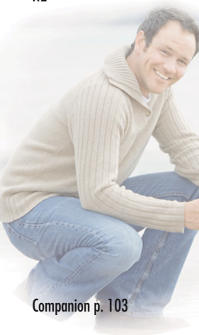
Companion p. 103

She works in Hamburg. He lives in Germany.