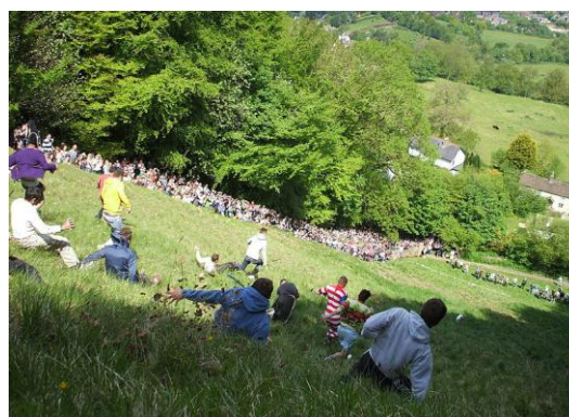
Cooper's Hill Cheese Rolling 2013