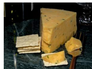
Double Gloucester cheese